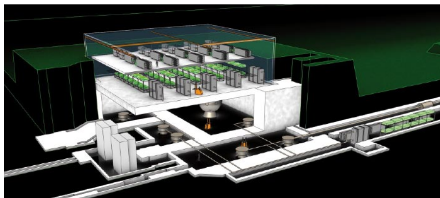
FIG. 3: ILE laser facility, housed in the former Accélérateur Linéaire de Saclay infrastructure. APOLLON laser is on the bottom right. ELI laser could be composed of 10 phased APOLLONS, if France were selected as the 4th ELI's pillar.