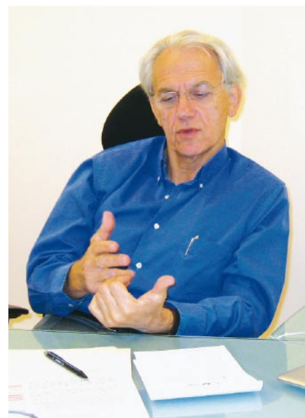
FIG. 2: Gérard Mourou is initiator and coordinator of the ELI project.

G. M.: Indeed, we can produce the highest peak power on earth. But we are not good in producing decent average power. For instance, with a terawatt system, we may have 100 pulses per second corresponding to an average power of about ten watts. It is vital for the field to improve the repetition rate. People working on laser fusion have the same problem. They are going to show the principle on a single shot per day basis. But for real life they will need to make it at a few tens of Hz. So my next project is to go to the kilowatt or even the megawatt level.