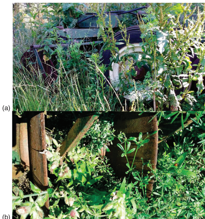
Figure 1.2 Images of agricultural machine left in a field for decades (a). A closer view clearly shows the presence of rust (b).