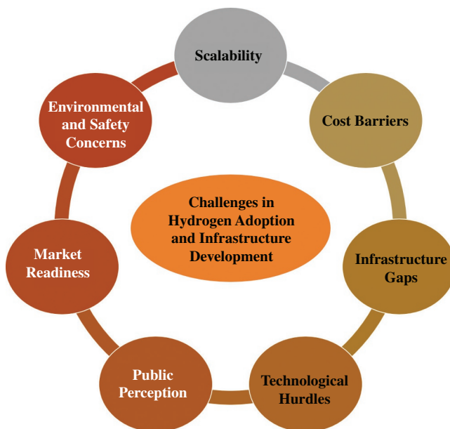
Figure 1.4 Key challenges in hydrogen adoption and infrastructure development.

Figure 1.4 illustrates the key challenges in the adoption and development of hydrogen infrastructure through a circular flow diagram. At the center, “Challenges in Hydrogen Adoption and Infrastructure Development” serves as the focal point, highlighting the interconnected nature of the issues. The diagram identifies seven major challenges: scalability, cost barriers, infrastructure gaps, technological hurdles, public perception, market readiness, and environmental and safety concerns. Scalability remains a critical challenge due to the difficulty in expanding hydrogen production and infrastructure on a large scale. Cost barriers, including the high costs of production, transportation, and storage, further hinder adoption. Infrastructure gaps, such as the limited number of refueling stations and inadequate distribution networks, restrict hydrogen’s widespread use. Technological hurdles involve the need for advancements in fuel cell efficiency and hydrogen production methods. Public perception remains a significant challenge, as skepticism and safety concerns