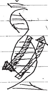
Antiparallel Dimeric Peptides