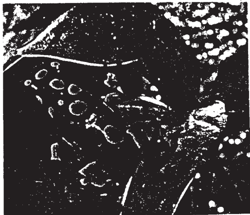
DENDROBATES HISTRIONICUS (SOUTHERN COLUMBIA)